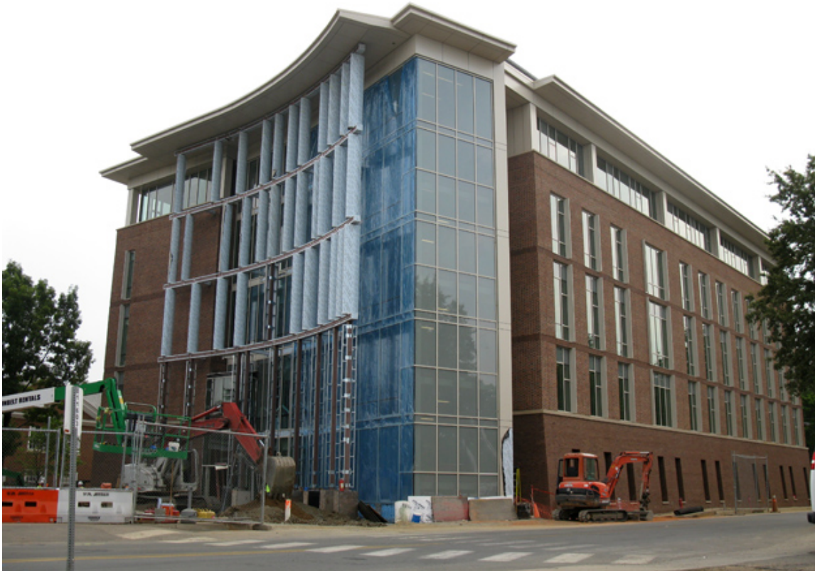
Figure 1 - Rice Hall Engineering Building

Submitted by Elaine Gall University Building Official August 2012