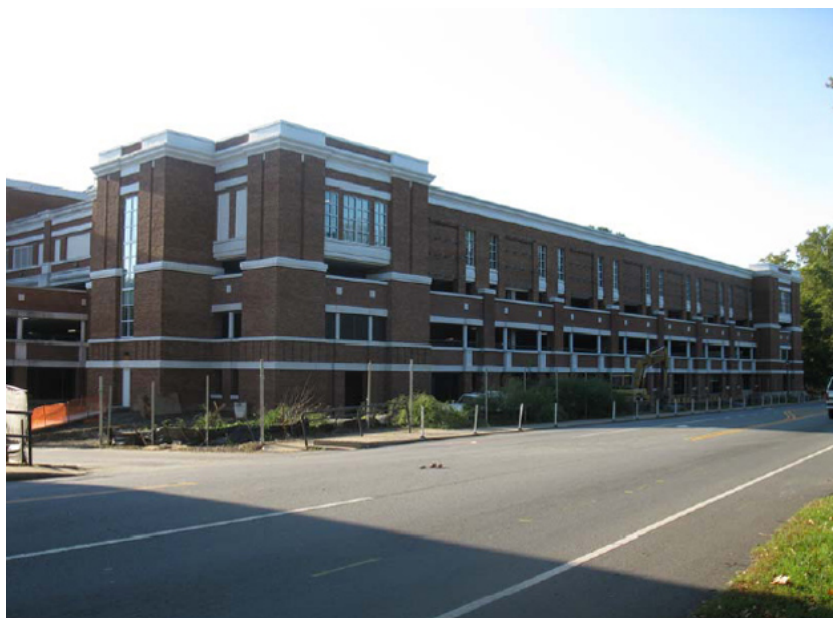
Figure 2 - University Bookstore Addition

OUBO invested significant time towards work related to strategic planning for the future. We further defined our current role at the University through the development of a Mission Statement. We also developed a Vision Statement based on how we foresee a successful transition into the future. OUBO staff jointly developed Organizational Goals to ensure we make progress towards improvements while continuing to handle our normal day-to-day activities. Finally, we participated with the Vice President for Management and Budget's Performance Assessment Initiative, seeking input from customers, benchmarking with other organizations, and implementing performance measurement models.