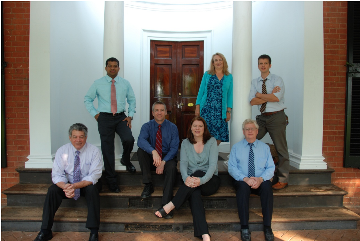
Figure 6 - OUBO Staff at Pavilion IX