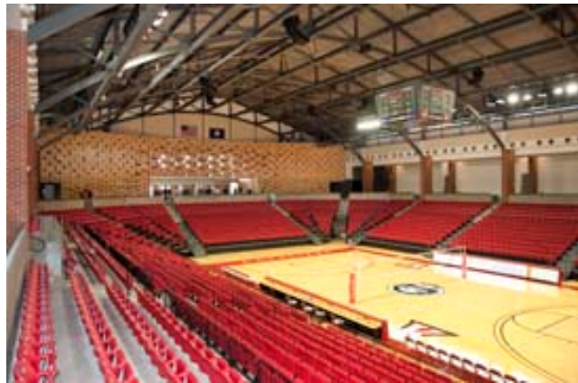
Figure 3 - David J. Prior Convocation Center

David J. Prior Convocation Center Smiddy Hall Renovations