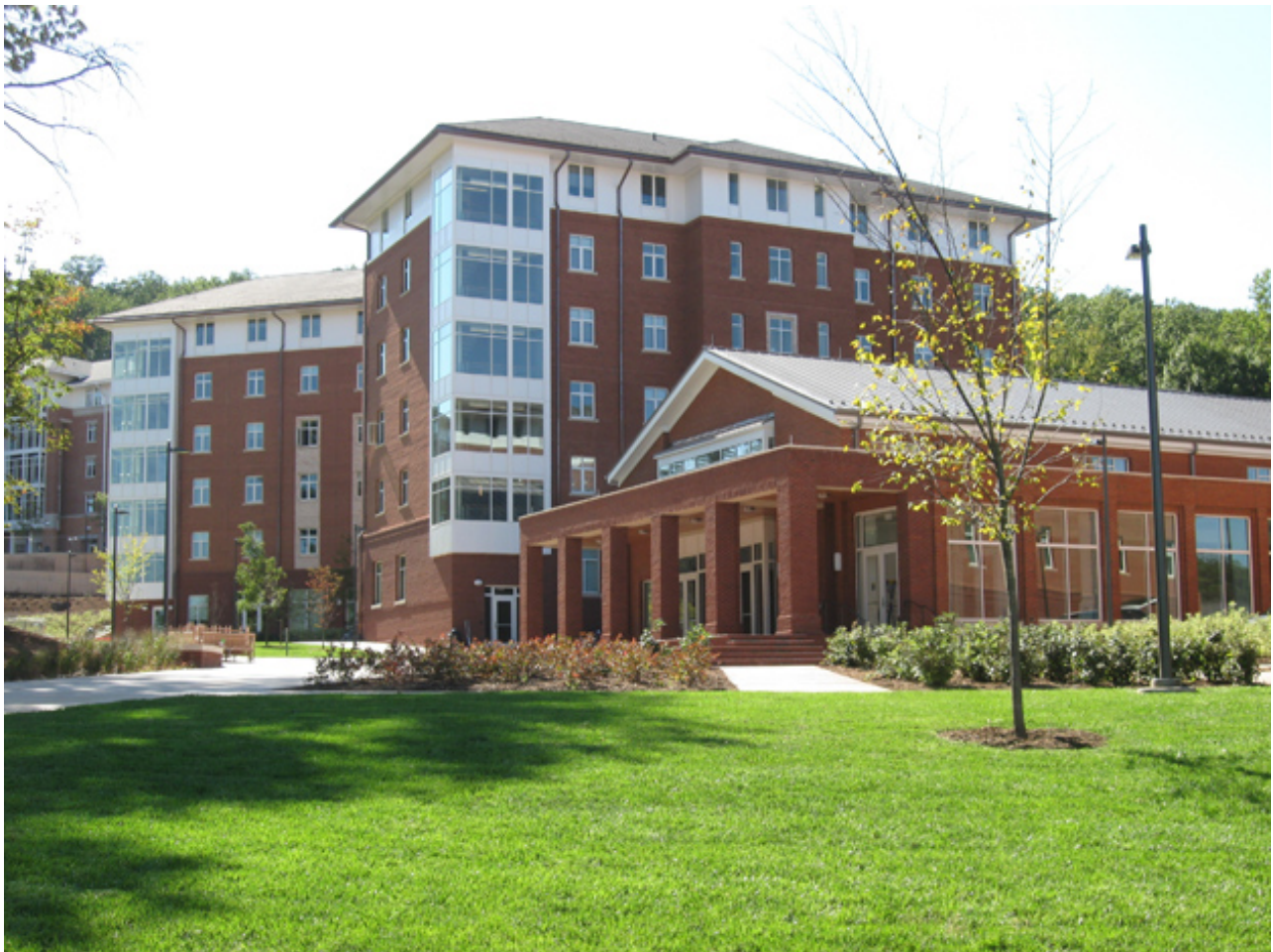
Figure 4 - Alderman Road Housing and Commons