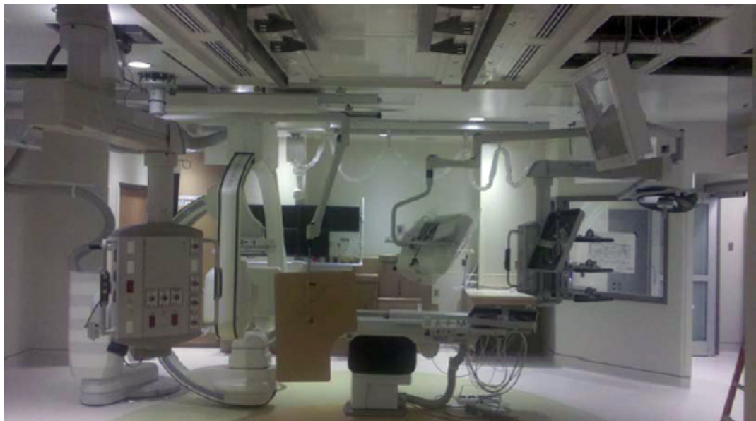
Figure 7 - IMRIS Operating Room