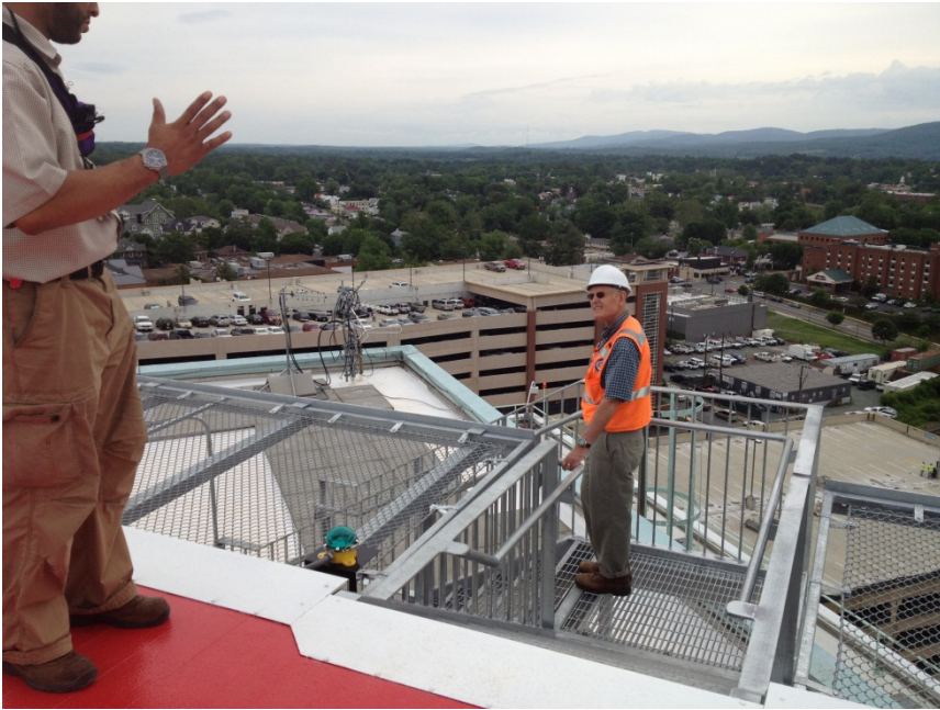
Figure 6 - Egress Inspections at Hospital Helipad

internal customers through participation in VPMB's Customer Feedback survey in April. We were very pleased with the positive results. However, results have been analyzed with an eye towards continuous improvement and an action plan has been implemented to address issues noted in the survey.