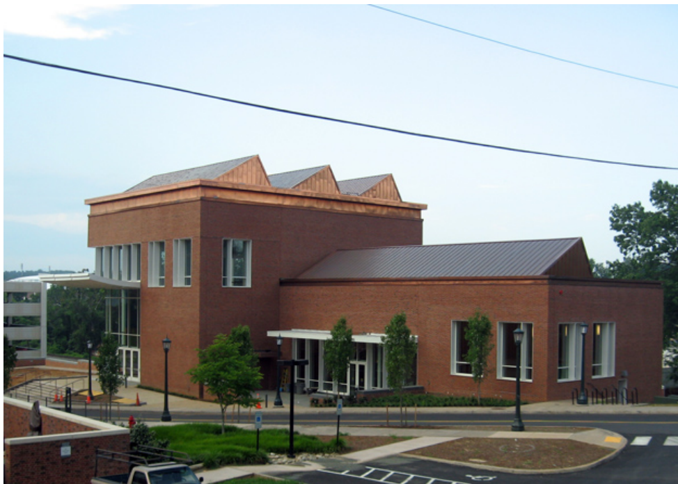
Figure 5 - Hunter Smith Band Building

This speaks to our desire to strengthen existing partnerships and explore new cooperative relationships to assist the University with plans for future development. We believe we can contribute our experience and expertise to the University in seeking creative but practical development for future space needs.