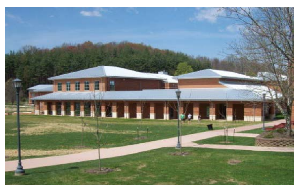
UVA College at Wise Arts Center - Occupied Fall 2009