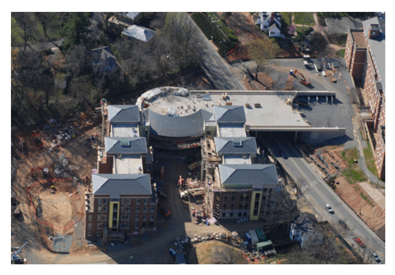
South Lawn Project – North and South Wings Occupied Fall 2009

In addition to the above, OUBO staff participated in 9 Value Management studies to identify cost savings, better functionality, and improved energy efficiency of buildings. Staff also updated the University of Virginia Design Guidelines to include requirements for desired design features for University of Virginia structures that are above and beyond the minimum standards of building codes. These include energy efficiency standards as part of our desire to minimize our carbon footprint and utility costs and security measures to improve student safety in classrooms.