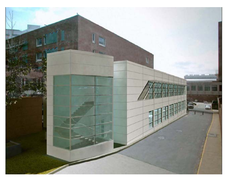
Primary Care Center Annex Occupied February 2010

The Annex to the Primary Care Center received three separate Certificates of Occupancy within a two-week timeframe. Just prior to opening for use as business offices, a large snowfall event was forecast for Charlottesville. UVA Medical Center requested permission to utilize the empty building for emergency sleeping quarters for hospital staff needing to stay in Charlottesville and close to the hospital during the storm. OUBO staff worked with the UVA Medical Center and Facilities Management to gain approval from the State Fire Marshal for this temporary emergency use to begin on February 4, 2010 which was followed by an extension for a second winter storm forecast for February 10. The building was finally occupied for its original intended purpose a week later on February 17.