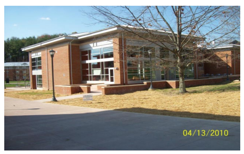
UVA College at Wise Dining Hall Occupied December 2009

New Residence Hall New Dining Hall Complete Renovation of the Science Building Renovations and Addition of the Arts Center Smiddy IT Wing