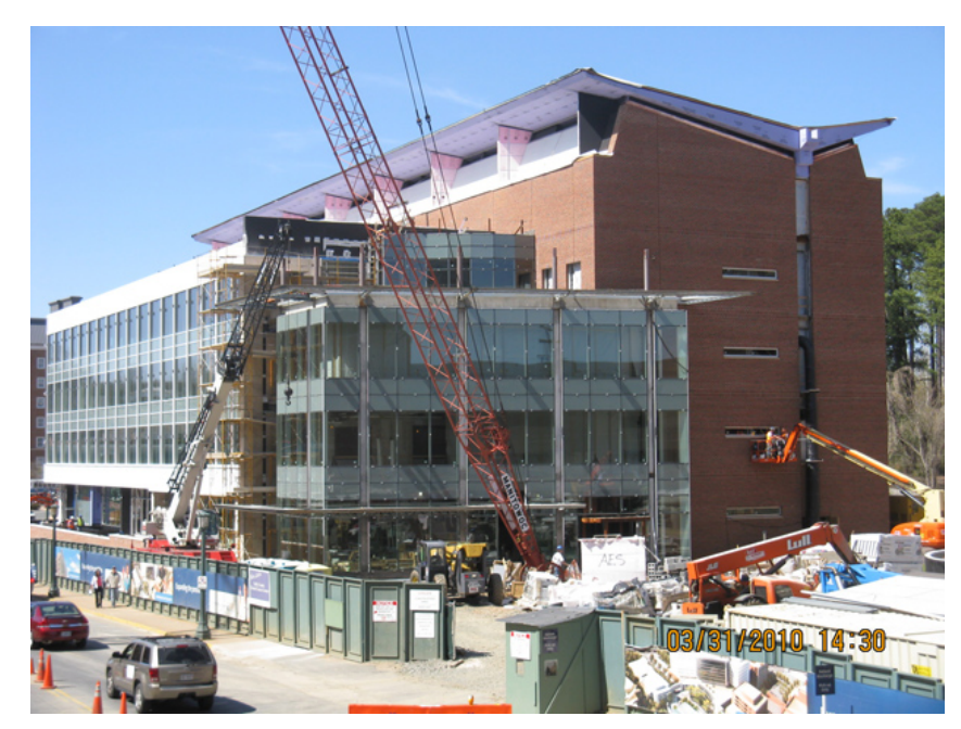
Emily Couric Clinical Cancer Center - Currently Under Construction

noted for that single installation. Once corrected, the contractor could then apply the knowledge gained for all remaining accessible showers and use the first as a prototype for the remaining. This helped to prevent the delays and expenses that would have been involved had problems not been noted until the end of the project.