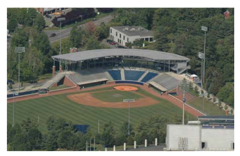
Baseball Expansion and Site of Four Additional Temporary Permits for Increased Spectator Seating - Occupied Spring 2010

particularly helpful to persons outside of Facilities Management less familiar with the process. Staff training related to issuing permits was also held to increase the number of staff members available for permit processing.